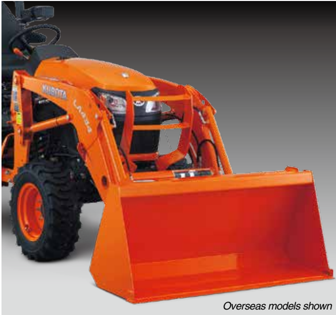
Overseas models shown