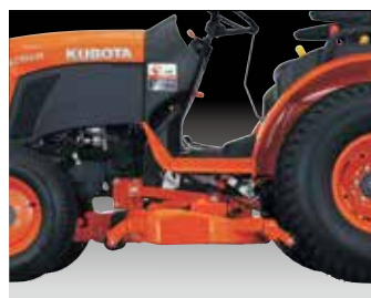
Cutting Height Adjustment Dial Suspended Mower Deck