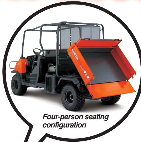
Four-person seating configuration