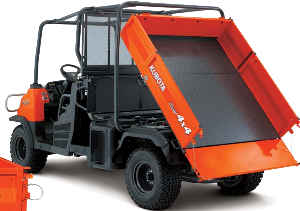
Two-person seating configuration